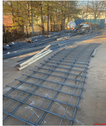
Rebar delivered to site