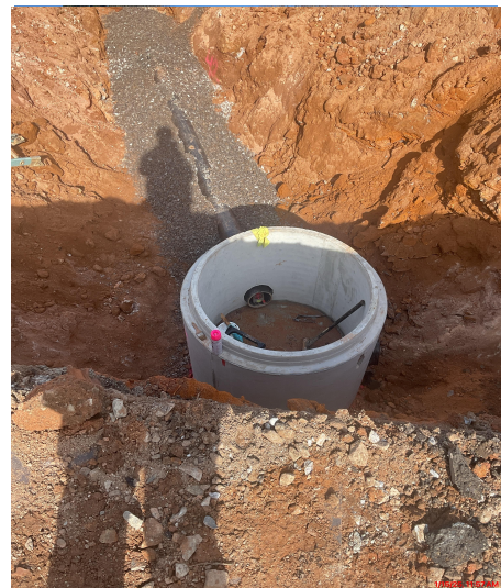
A2 Sanitary Sewer line installed