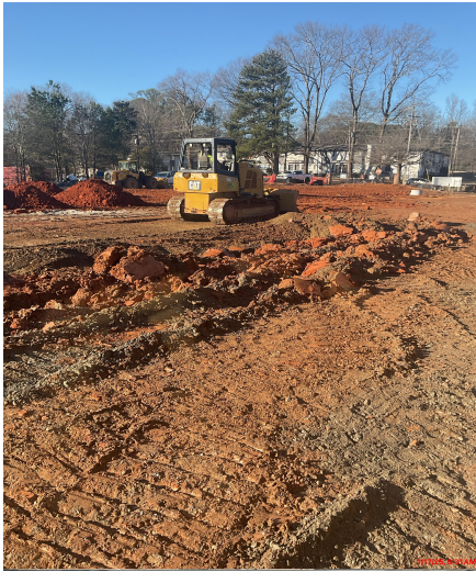
Phase 2 building pad in progress