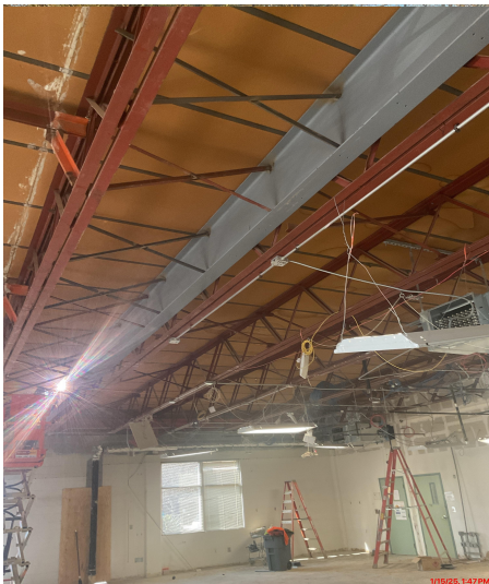
50' beam installed